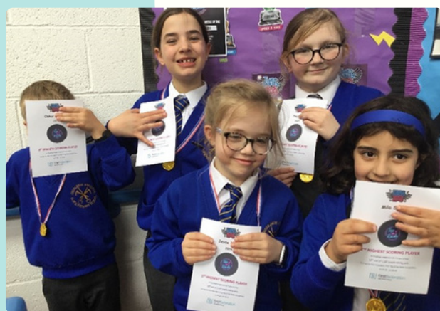
Chudleigh Knighton Primary School

Congratulations to Aveton Gifford Primary School who were overall winners and to Year 3/4 at Brixington Primary who were the Top Class with 9,253 questions correct - both have received a fabulous trophy and maths book for their tremendous efforts.